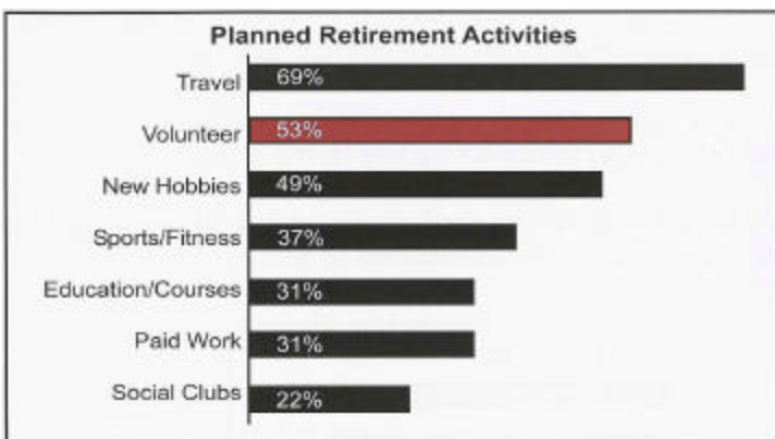
Source: GQ SERV, The California Assessment of Seniors and Service, La France Associates, June 2001