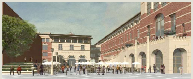
The EC will get a sneak peek at the new Campus Center before its official opening in August.